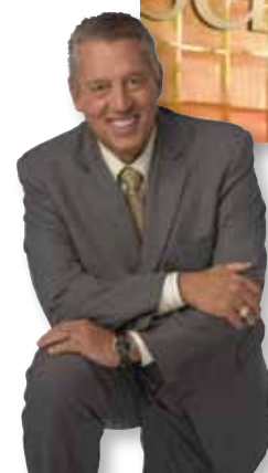
John C. Maxwell