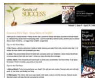
Seeds of SUCCESS